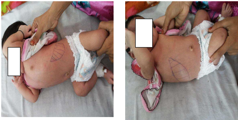
Fig 1 & 2: Baby Showing Hepato-Splenomegaly

On admission the infant was febrile, with excessive cry and refusal to feed. Physical examination showed pallor, hepatomegaly (3 cm below costal margin), splenomegaly(4 cm below costal margin). Respiratory and cardiovascular systems were normal.